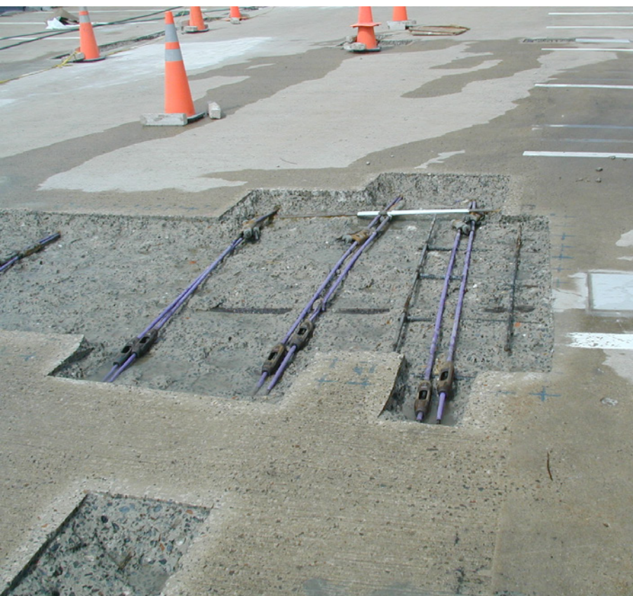
Replacement of a greased sheathed strand section

Unbonded internal prestressing tendons generally comprise individually greased and sheathed strands, incorporated into the element during concreting.