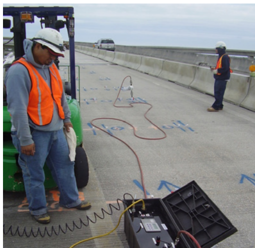
Volumetric measurement of injection voids