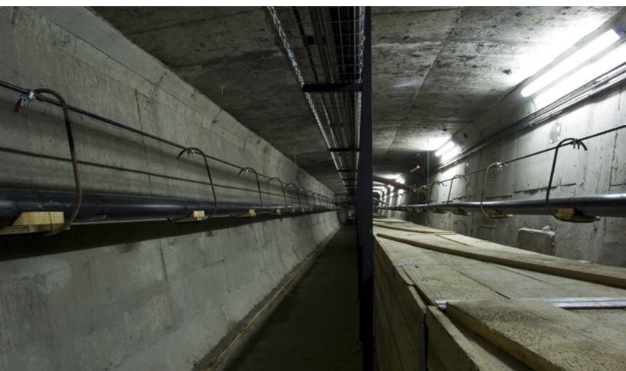
Final additional prestressing