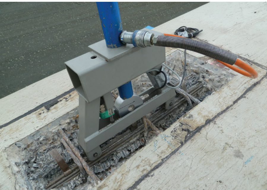
Verifying the force in a prestressing tendon using the crossbow technique

Freyssinet offers inspection solutions for assessing the integrity of prestressing tendons.