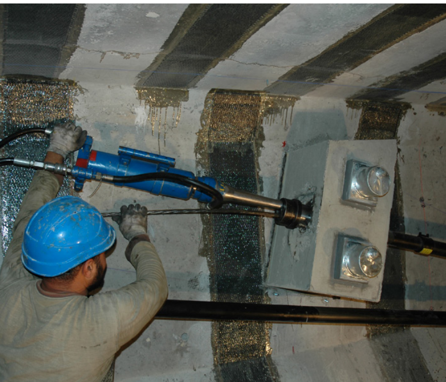
Individual tensioning of greased sheathed strands

Bonded internal prestressing tendons comprise a bundle of strands housed in a corrugated plastic sheath injected with cement grout and placed inside the concrete.