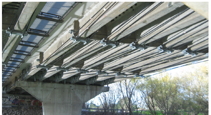
Additional prestressing for a viaduct featuring independent spans with prefabricated prestressed concrete beams