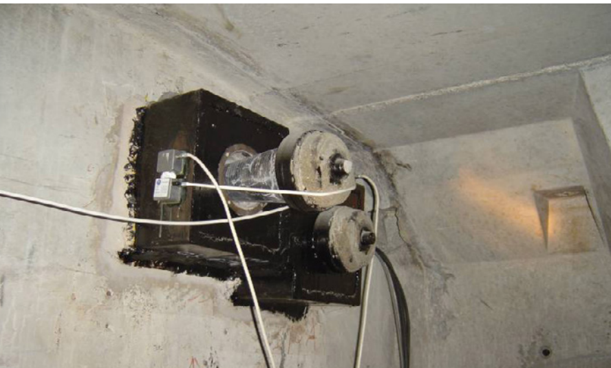
EverSense® Acoustics sensors

Freyssinet provides instrumentation solutions for real-time monitoring of tendon ageing.