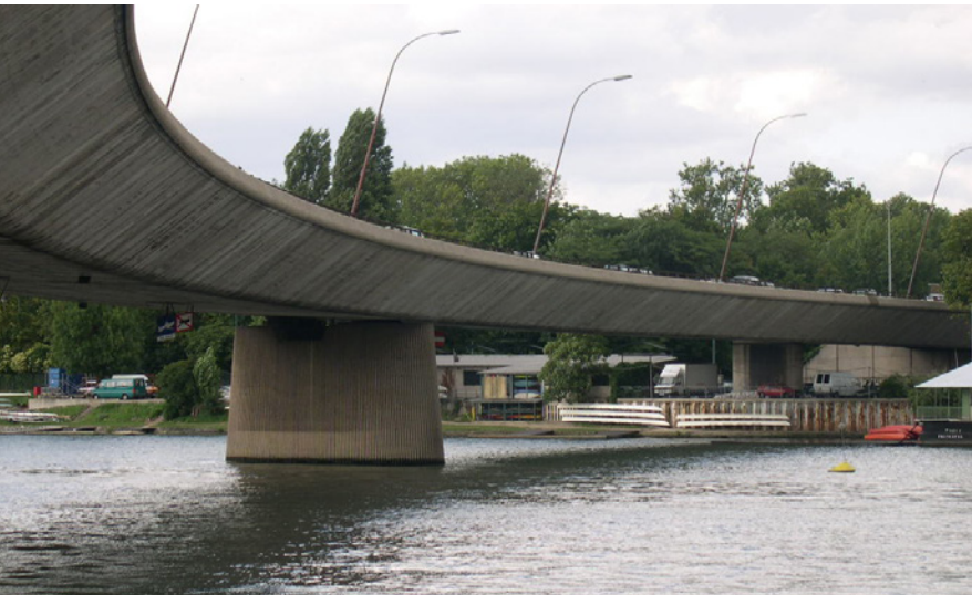
Saint-Cloud viaduct, France