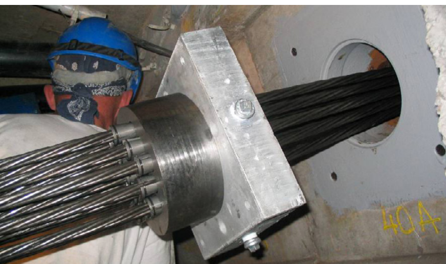
New prestressing anchoring

The previous design for external prestressing tendons generally used a bundle of prestressing steel tendons housed in a plastic sheath injected with cement grout.