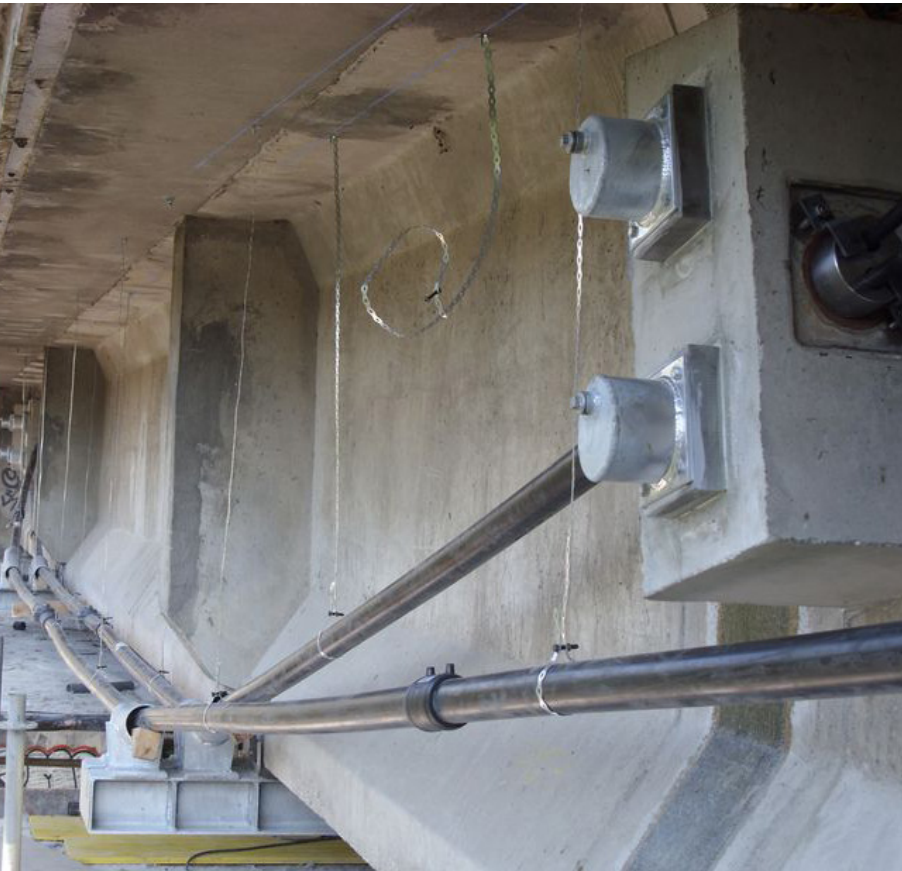
Additional prestressing of a beam